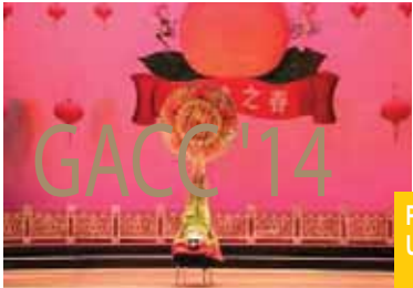
PESTA TANGLUNG UKM KE – 34